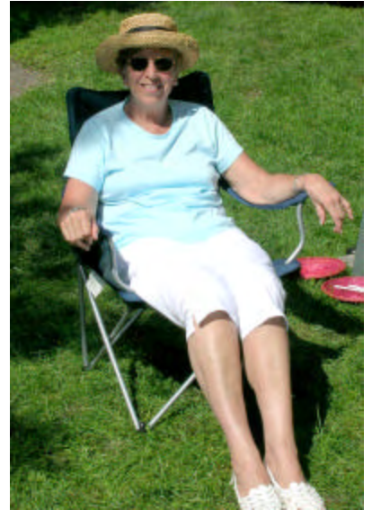
Rendezvous, Mid-Hudson Power Squadron