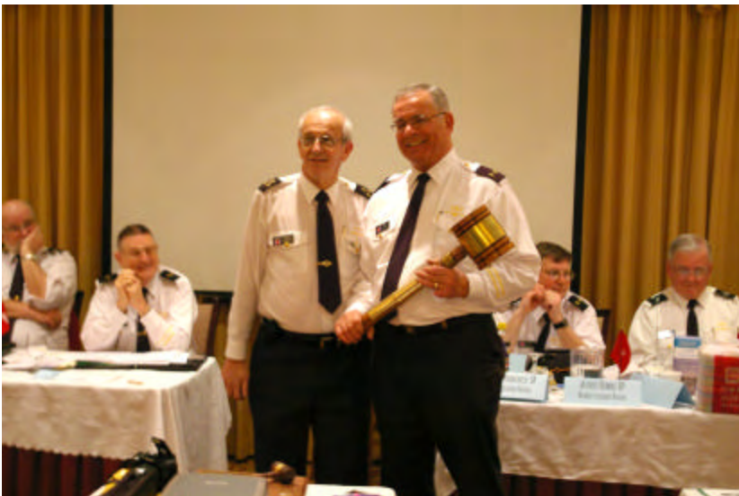
Outgoing and incoming D/2 Commanders 2008 Change of Watch