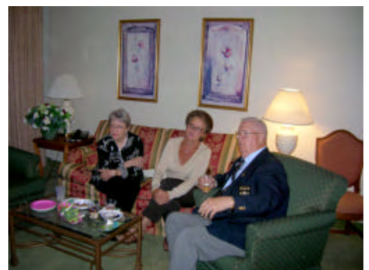
National Governing Board, Detroit, MI