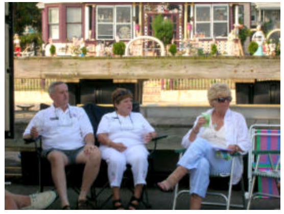
Summer Council, Bridgeport, CT