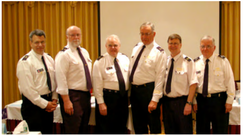
D/2 Change of Watch 2008