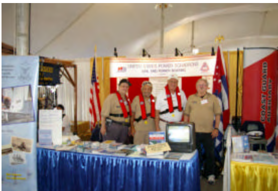
Norwalk Boat Show, Norwalk, CT