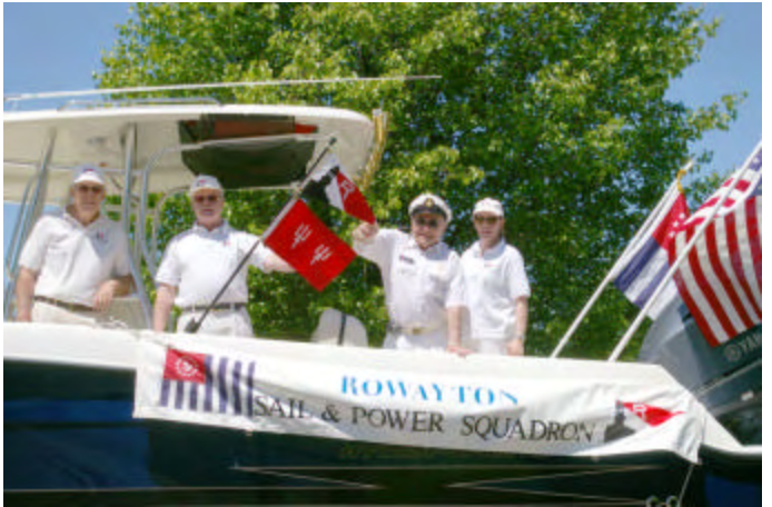
Rowayton Memorial Day Parade