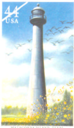
MATAGORDA ISLAND, TEXAS

When the job is completed sit down with a libation of choice and toast the fun times of past seasons and look forward to a new and enjoyable boating season in 2010. Here is hoping we all have a healthy and happy winter wherever we are and what ever we are doing.