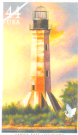
SABINE PASS, LOUISIANA