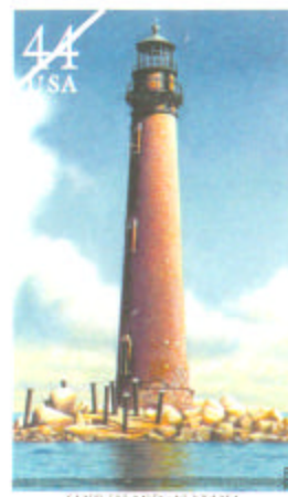
SAND ISLAND, ALABAMA