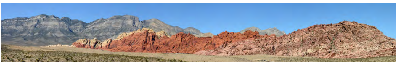
Red Rock Country Near Las Vegas, NV