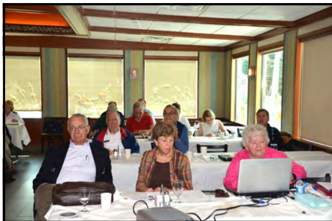
Another view of D/2 Attendees