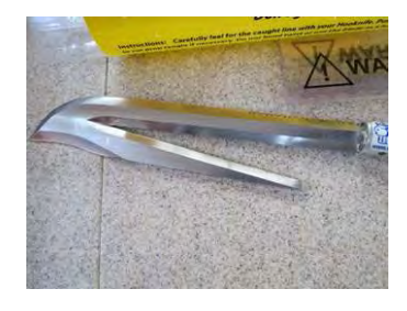
Rich Stidger, SN