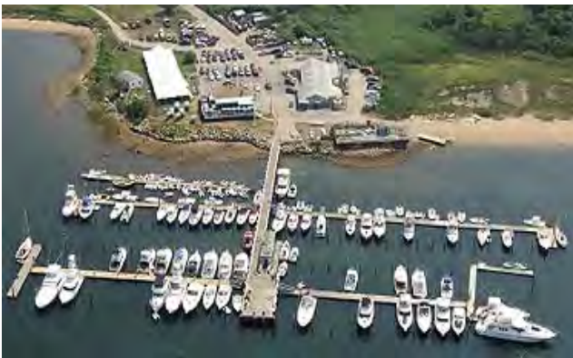
Block Island Boat Basin West Side Road (401) 466-2631 ~ Marine Channel 9