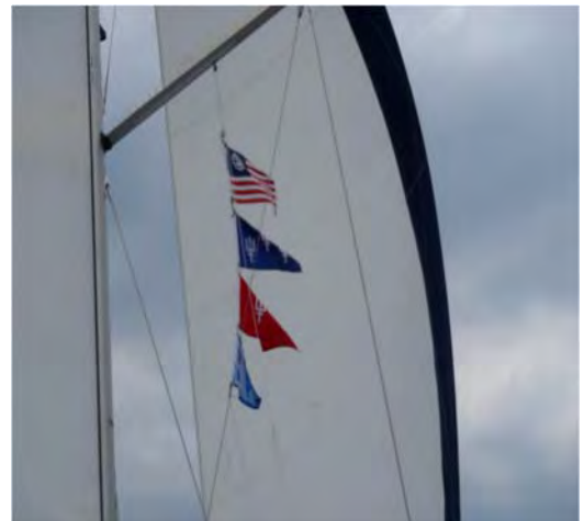
2015 BSPS Spring Rendezvous at Goddard Park, Greenwich Bay, Rhode Island