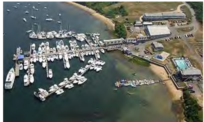
Champlin's Resort and Marina www.ChamplinsMarina.com (401) 466-7777 ~ (800) 762-4541 Marine Channel 68