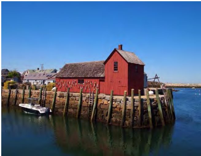
Motif No. 1 Rockport MA