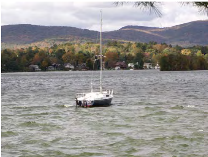
Pontoosuc Lake last Fall