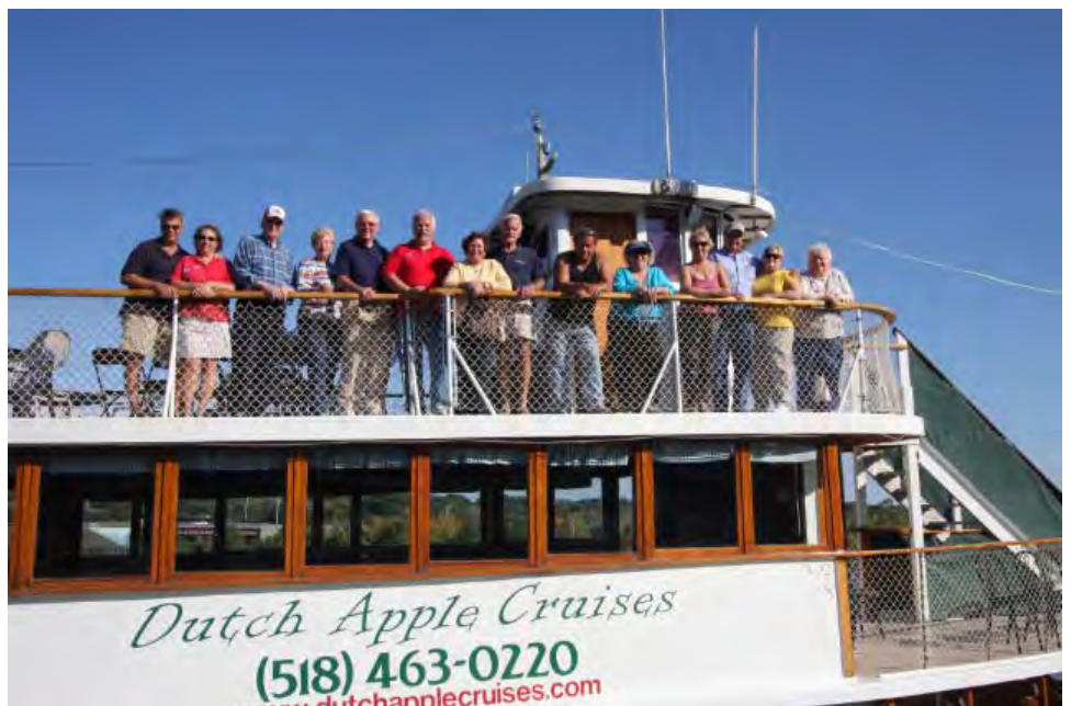
Dutch Apple Hudson River Cruise with Berkshire Sail & Power Members on board (Albany, NY)