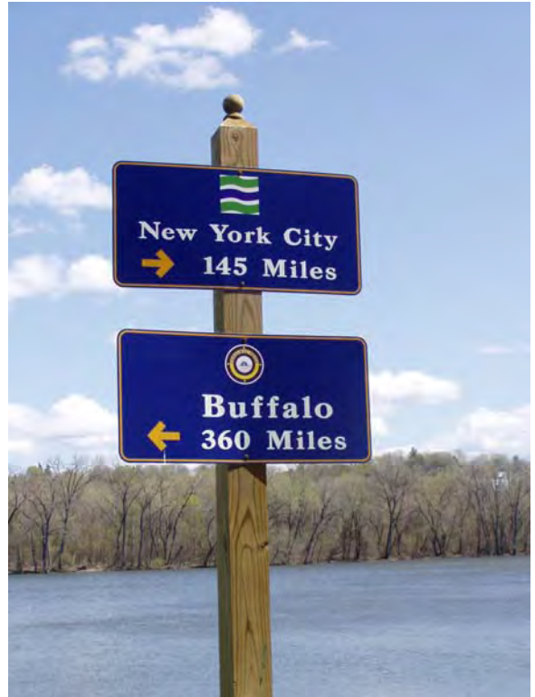
Sign on the Hudson River (Near Erie Canal)