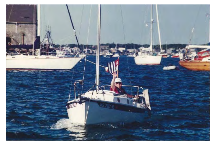
NO BOOM in PROVINCETOWN!!

On the trip back, no adventures were had and the boom was located where it was left. Why this story? To prove that we all have had the really bad boating days which on looking back were some of the best — the Squadron has terrific helpers, great friends and people who have the bestest boating stories. Who was the boater? Why me of course! Who else would leave their boom and have cleats too small and not check where to launch? But this was one of the best weekend's I had — with absolutely the best and worst of times.