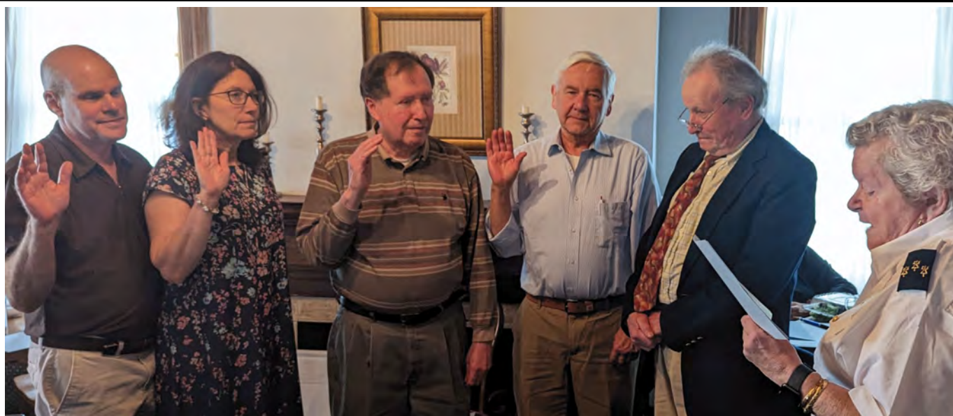
Left to right: THE 2023-2024 BERKSHIRE BRIDGE