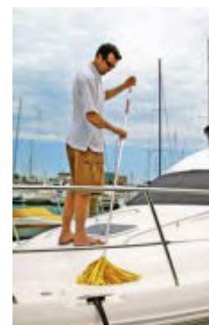
Illustration 1: Want to wash down your boat? You'll need an EPA permit!