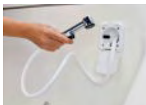
Want to take a shower in your boat? You'll need an EPA permit