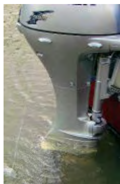
See that stream of cooling water coming from the engine? You'll need an EPA permit!

Time is quickly running out. On Sept. 30, 2008 the EPA will be requiring permits for ANY water coming off your boat. Two weeks ago a bill -- S. 2766 -- was introduced into the senate to stop this fiasco that could kill boating as we know it. Kill it because boaters will refuse to pay for this Alice-in-Wonderland nonsense permit. To find out what is going on, what the chances are to stop the madness, and what you can do about it, click on the links below. Remember, this isn't the first time government incompetence has decimated our sport!