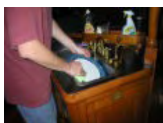
Washing dishes on your boat? You'll need an EPA permit!