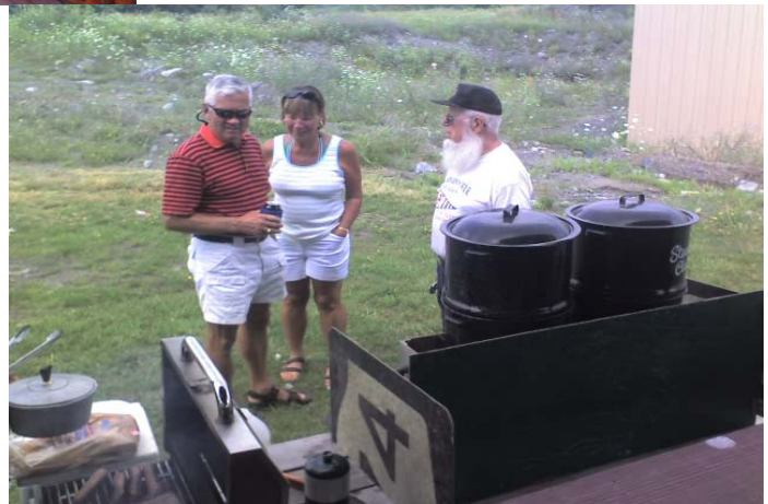
ARE THE CLAMS READY YET?