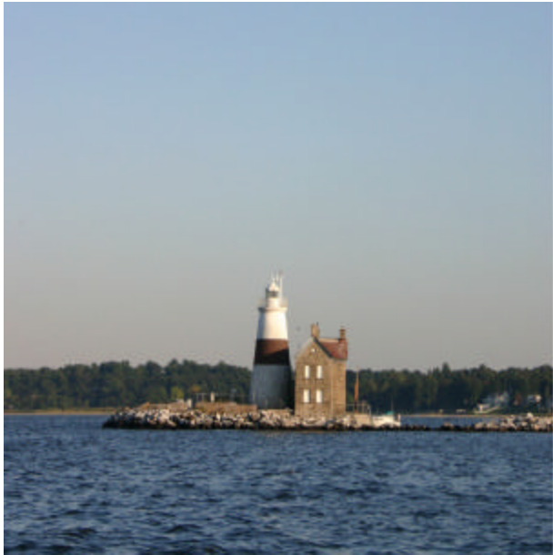
EXECUTION ROCKS LIGHTHOUSE LONG ISLAND SOUND, N.Y.