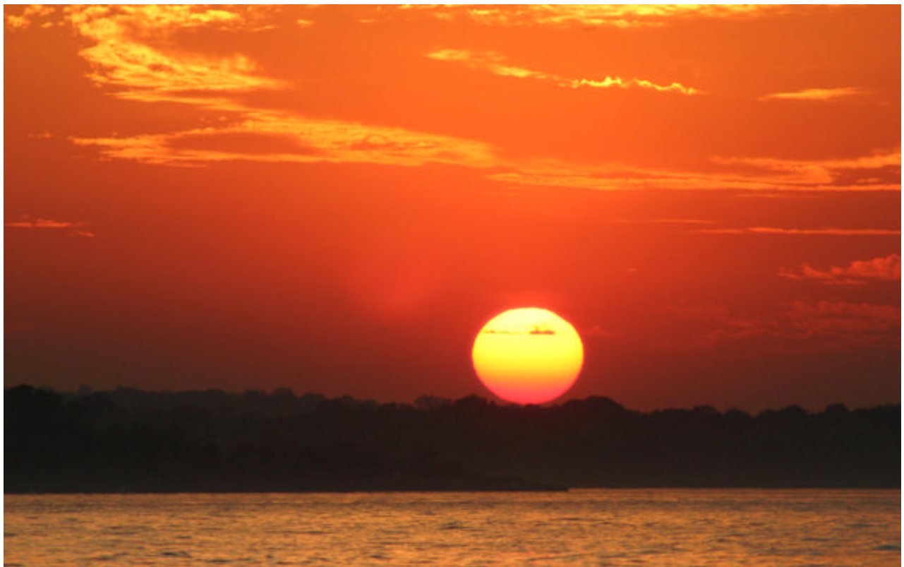
Sunset over New Rochelle, NY, from Long Island Sound.