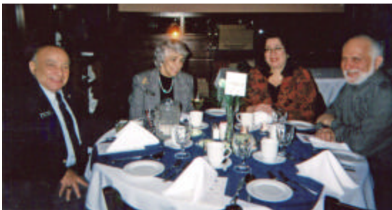
All photos courtesy of P/C Virginia P. Moore,