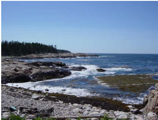
Pocket Beach—Long Island, Maine

The holidays are over and spring is four months off. What's a boater to do?