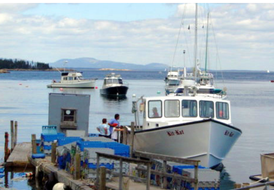
Lobster boat unloading its catch. Lunt Harbor, Long Island, Maine

The islanders are very friendly and they even have a museum of island life and history.