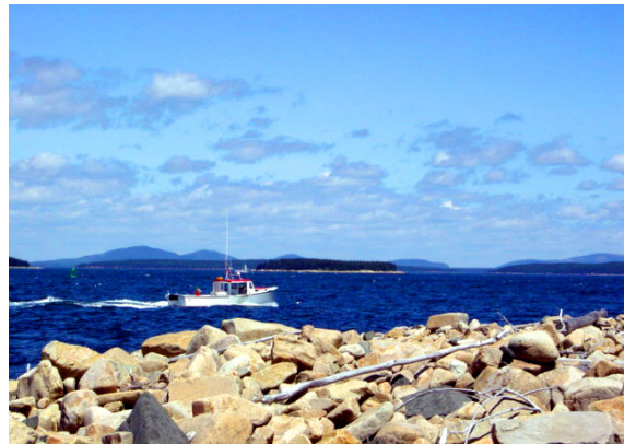
Lobster Boat off Long Island. Mt. Desert Island is in the background

There is great lobster and pie right at the dock. One time we had crab quesadias made from the local catch, Yummy!