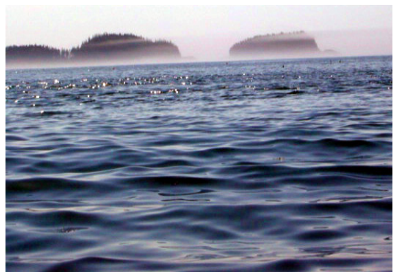
Kayak's-eye view Rogue Island, Maine (about 40mi. from Canada)

There is a gift shop and high quality artwork for sale. The woman at the cash register was happy to talk. Making a personal connection in a remote place makes the whole experience really stand out.