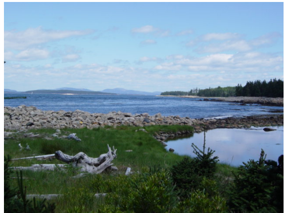
Long Island View

Finding new places to visit is the goal. A familiar harbor can be used as a reference. Read the description in a cruising guide and compare a new place with the old familiar place. Think of the best places to visit. What things did you do there?