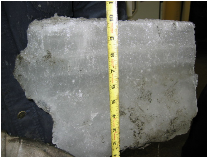
Chunk of Ice from Five Mile River

“A Unit of United States Power Squadrons”