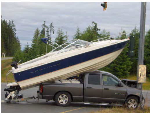
How Not To Tow A Boat

If approached by a law enforcement or fire rescue vessel using its lights and audible signal, a vessel operator is required to (1) immediately slow to a speed just sufficient to maintain steerage only; (2) alter course within its ability to not inhibit or interfere with the law enforcement or fire rescue vessel; and (3) unless otherwise directed by an officer onboard such vessels, proceed at a reduced speed until beyond the area of operation of the law enforcement or fire rescue vessel.