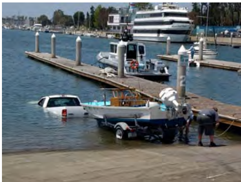
How Not To Launch A Boat