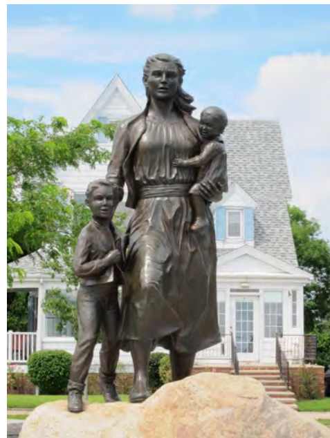
Fisherman's Wives Memorial Gloucester MA

After you successfully freeze your report, you will receive in the mail a PIN that you must use to unfreeze the report.