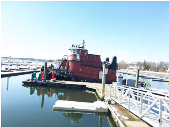
Tug for Compo Channel Dredge at Compo dock.

BoatUS advises that while the USCG does send official annual renewal notices by US mail, other notices being received by members are not from the USCG but rather third-party companies whose name or return addresses may appear similar to that of the official USCG Vessel Documentation Center. Members of the half-million boat owners group report the letters look like "real" USCG communications. Some examples members have forwarded to BoatUS do not have any disclaimers noting that they are not official USCG correspondence. the USCG National Documentation Center website at www.uscg.mil/nvdc and click on instructions and forms."