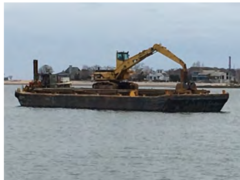
Compo Channel Dredge