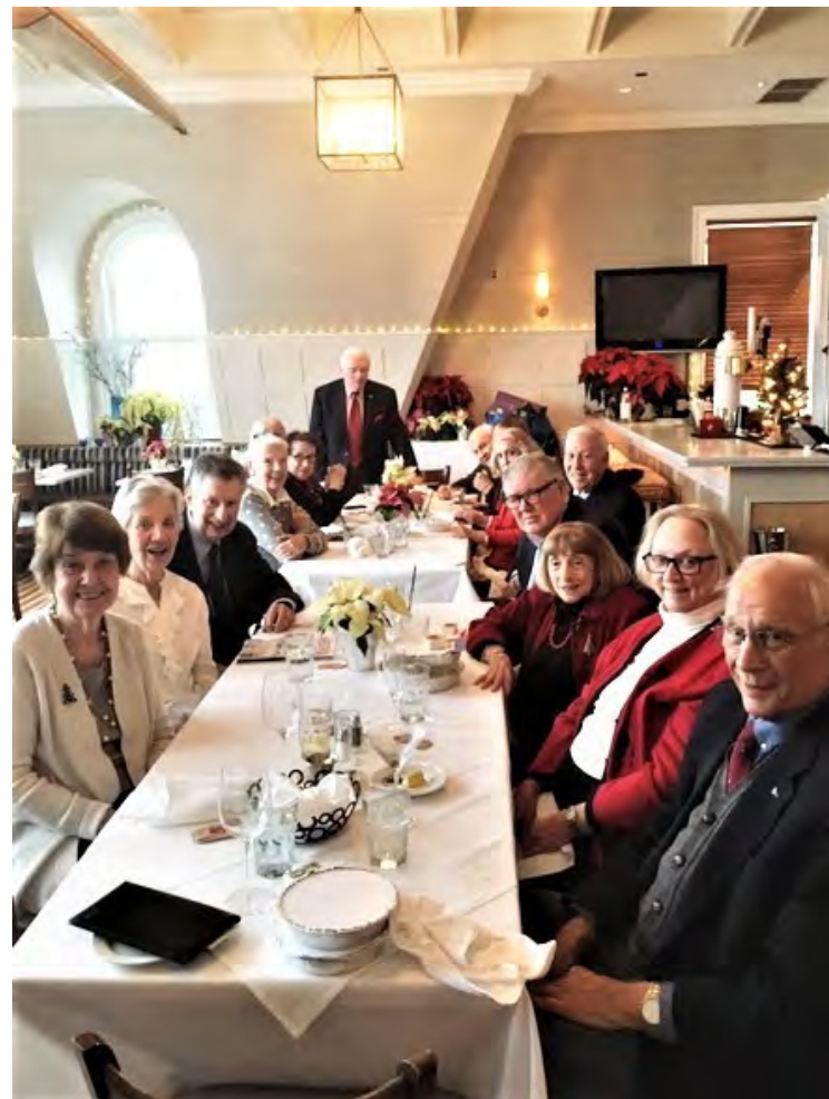
Holiday Party Boathouse Saugatuck Rowing Club