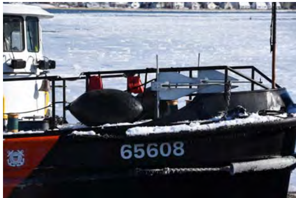
Coast Guard Cutter Pendant breaking ice on the Weymouth Fore River

Of the heating oil used in the country, more than 85 percent is consumed in the Northeast, and 90 percent of that is delivered on a Coast Guard maintained waterway by ship.