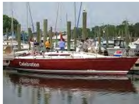
Celebration the Ship 6 boat

It's hard to eat, You're wet most of the time Going to the bathroom is a chore -Ted Turner sailing a 38' boat to Europe