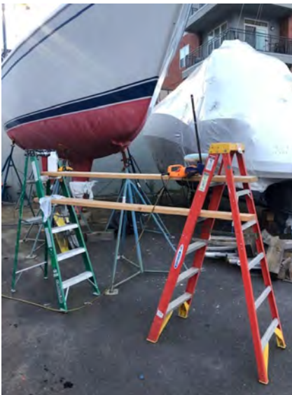
Craig Burry, P Commander

So on to the good times out on the water. Let us never forget that USPS teaches us the joy of boating comes with the obligation to put safety first at all times. You as captain of your vessel must always practice responsible safe boating so that you and your crew will always be safe while having fun.