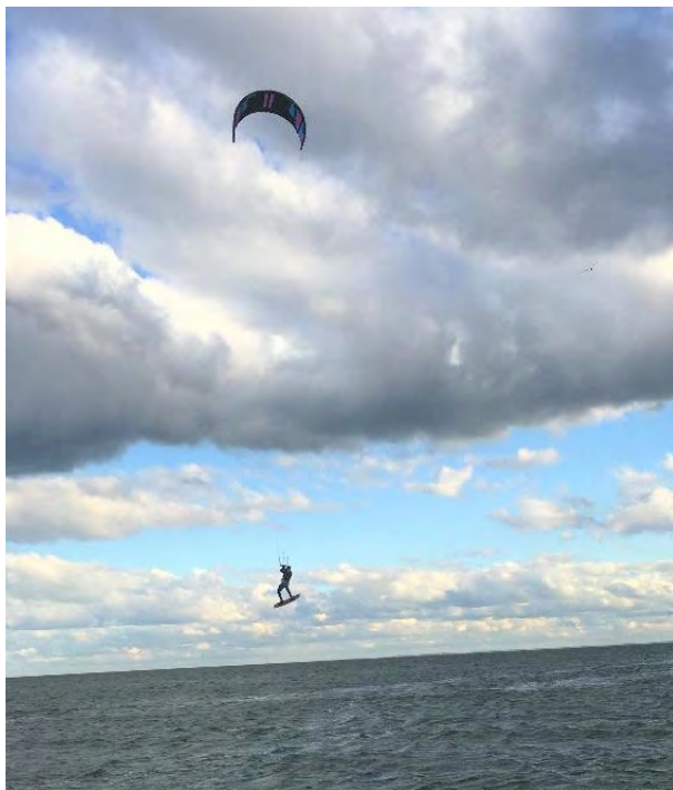
Parasailing at Compo Beach