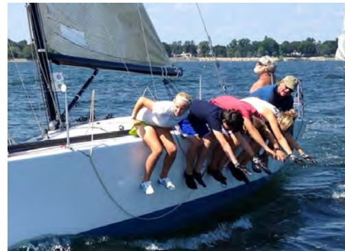
Cedar Point Racers

They were then transported to Captain's Cove. The United States Coast Guard is investigating this accident.