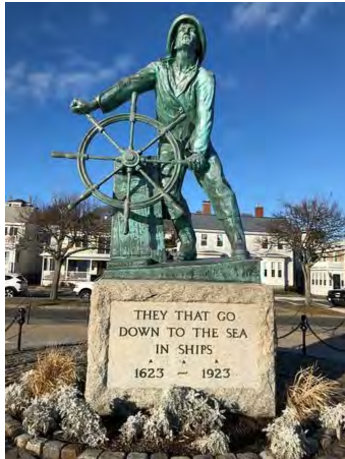
Fisherman's Memorial Statue Gloucester MA

Saugatuck River Sail and Power Squadron is a unit of the United States Power Squadrons® and District 2.