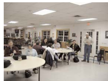
Class is working hard to understand the necessary plotting and charting techniques