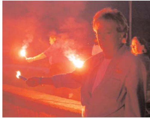
Flare Demonstration at our Annual Picnic at CYC