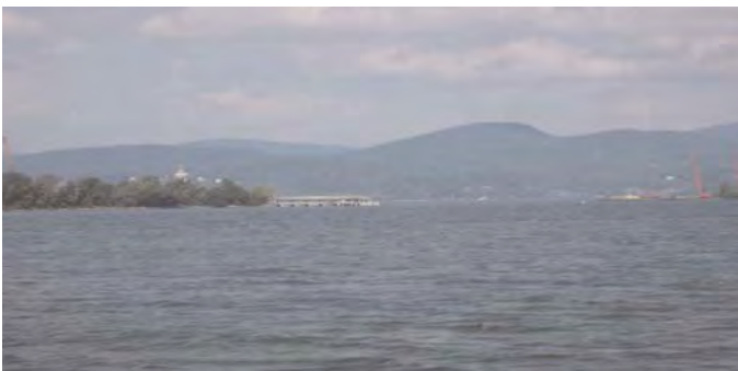
Entering Chimney point, Vermont on Lake Champlain