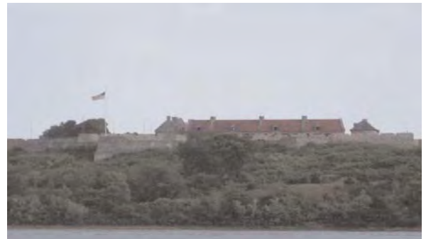
Fort Ticonderoga, Lake Champlain

Moskowitz 6785 Via Bellini Lake Worth, Florida 33467