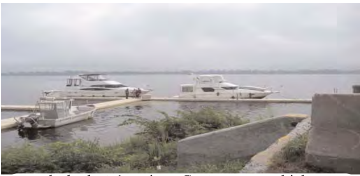
docked at American Customs - see high powered chase boat lower left.