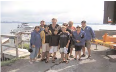
the gang at the American Customs: