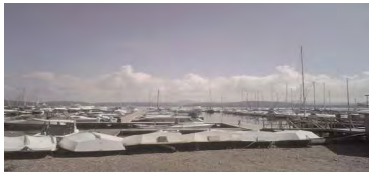
docked at beautiful Mallett's Bay