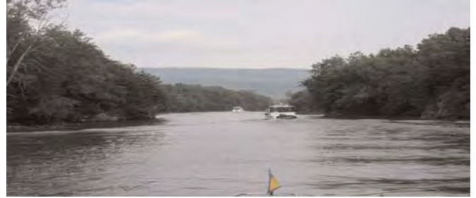
Traveling the beautiful Champlain Canal