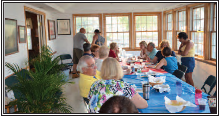
With the hot and humid weather, some attendees stayed in the air conditioned clubhouse, while others braved the beautiful evening on the lawn.