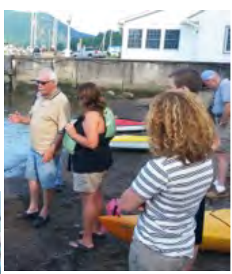
SKPS and CYC Support the Special Cold Spring Kayak Club's Kayak Safety Program.