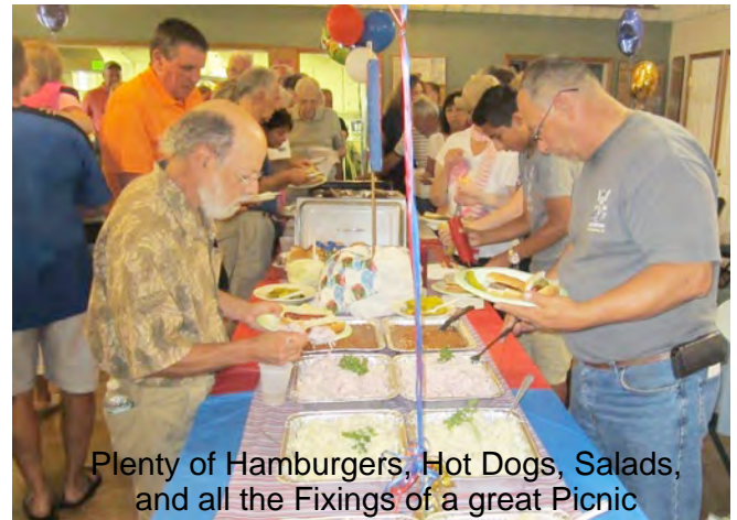
Plenty of Hamburgers, Hot Dogs, Salads, and all the Fixings of a great Picnic