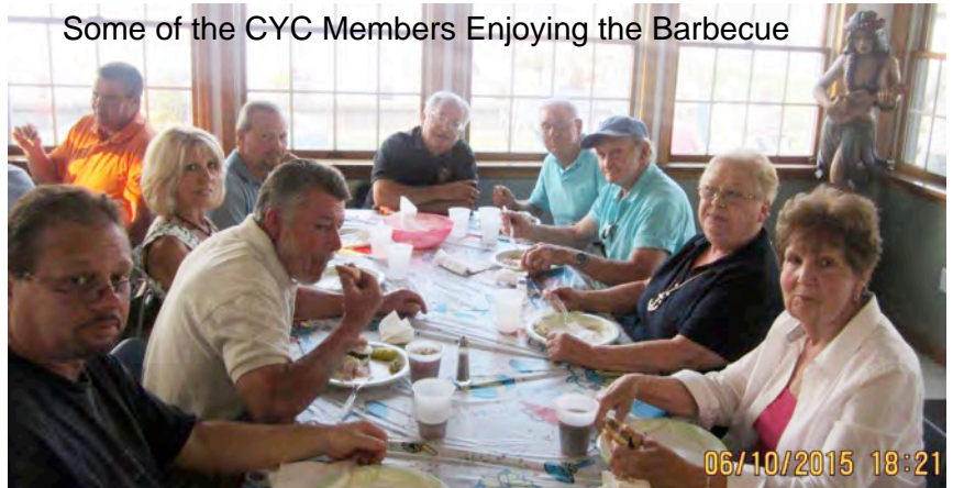
Some of the CYC Members Enjoying the Barbecue