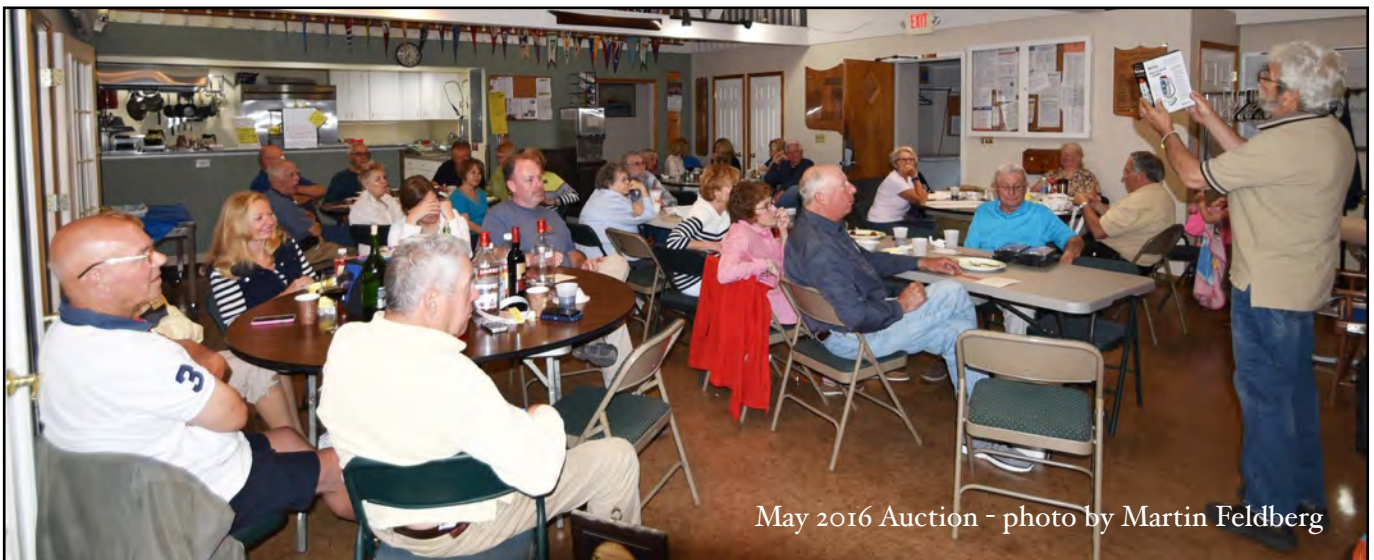
May 2016 Auction