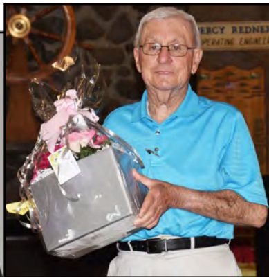
May 2016 Auction Winners!