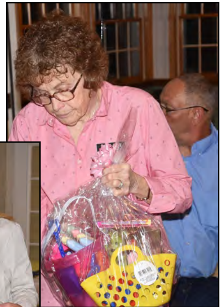
May 2016 Auction