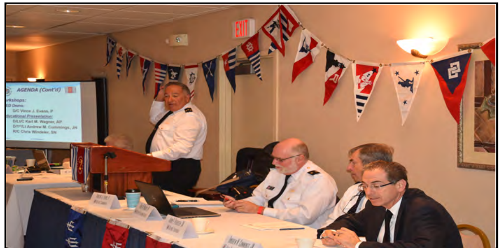
The above photo was taken at the District 2 Fall conference which was held in Danbury, CT. on October 08, 2016 At the tables are members of the D2 Bridge.