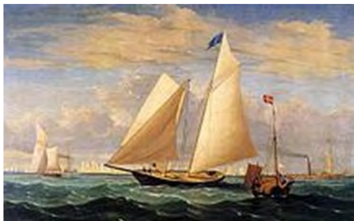
The Yacht 'America' Winning the International Race, by Fitz Henry Lane , 1851

(If we missed your birthday, please let us know!!)