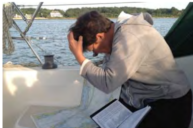
Checking the tide tables

Our plans were to go to Port Jefferson, Branford, Westbrook, Shelter Island, Stonington, and anywhere else time and tide would allow. A two week cruise in our area gives us a good sampling of all kinds of weather conditions. There was no wind and fog as we headed to Port Jefferson but going to Branford we encountered 18 knot SW winds and 4ft seas on our starboard quarter. On the way to Westbrook we sailed with 18 knot N winds under a shortened jib.