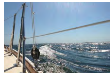
5ft seas and S winds

Being wrong could mean sailing for a long time without any progress. On our next to last day sailing to Port Jefferson we ran into rain in the morning and heavy clouds afterward with 12 knot winds. At one point we saw an unusually shaped cloud that Ruth (having grown up in the mid-west) immediately recognized as a funnel cloud almost directly overhead. Luckily it dissipated instead of touching down. We had a safe and relatively quiet night anchored inside NW Port Jefferson Harbor with winds about 24-28 knots. The winds moderated overnight and we had a comfortable sail home to Stamford on our last day out.