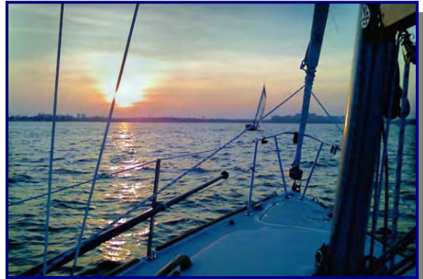
A beautiful sunset from FRA-JO-LI