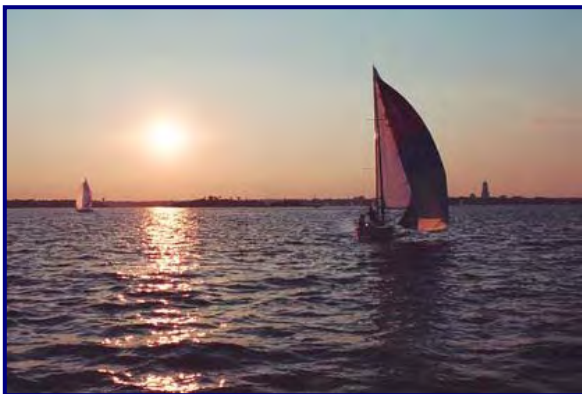
The end of a pleasant evening sail