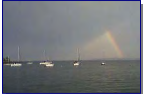
The rainbow after our cancelled sail