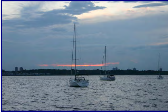
Sunset near Eastchester Bay