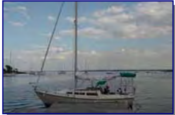
TRU LOVE waiting for the crew