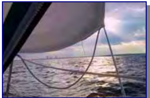
Evening view from TRU LOVE