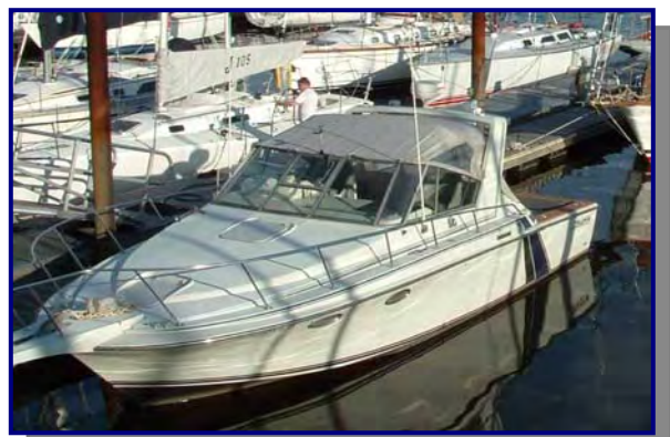
GREEN STAMPS at the dock