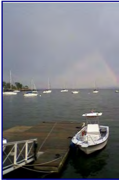
Rainbow on the Sound